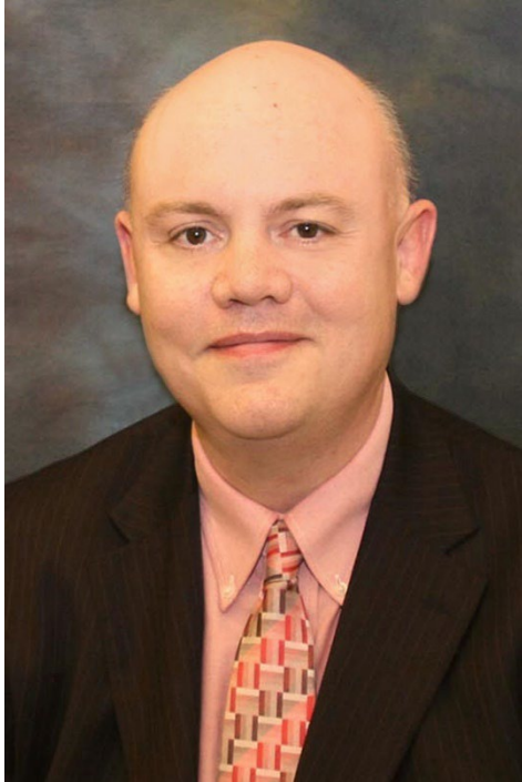
Chris Waddle, Vice-President