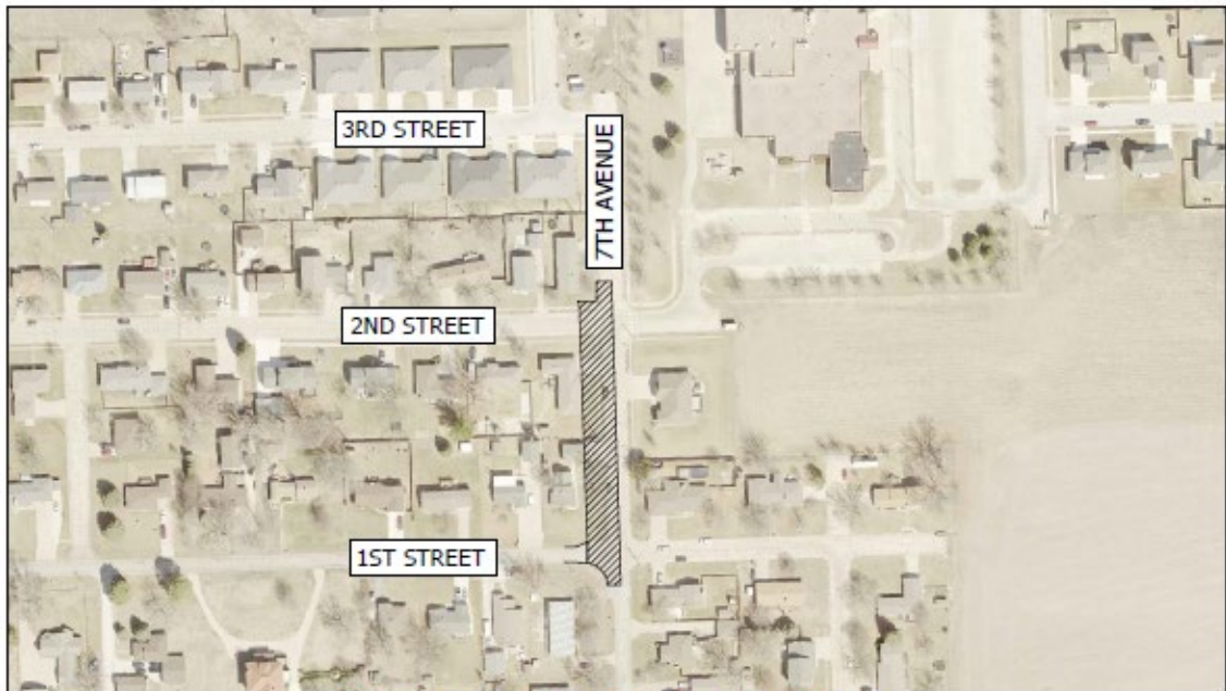
ENLARGED SITE LOCATION