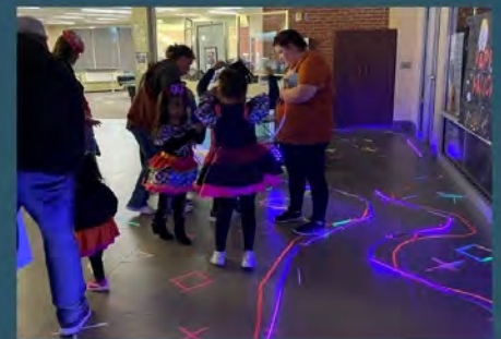
Spring 2021 - Pilot Events