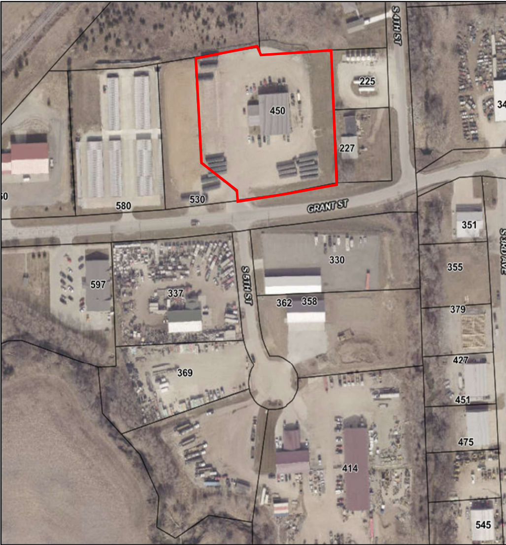
450 Grant Street: Lot 3, South Acres Second Addition Zoning: