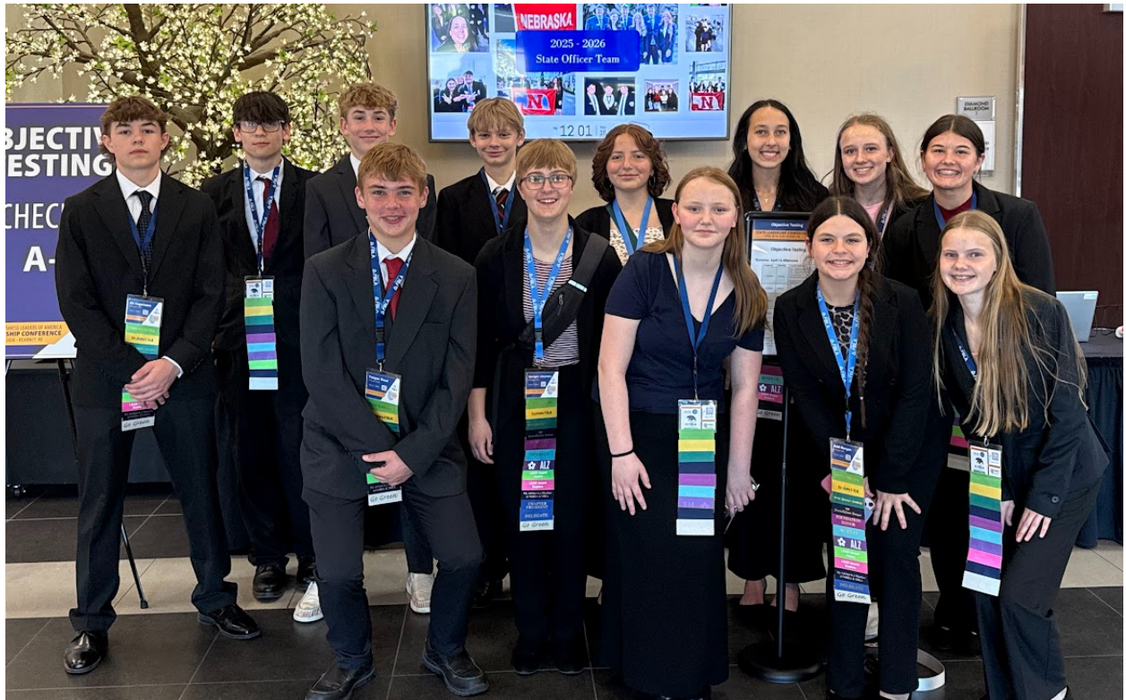
8 th grade