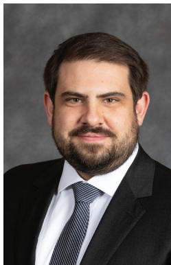
Sen. Eliot Bostar District 29