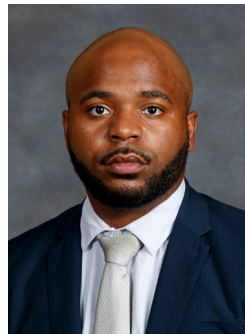
Sen. Terrell McKinney District 11

Under the Act, municipalities will be eligible to apply for state aid in the form of grants which may be used to assist in funding a variety of municipal infrastructure projects, including: solid waste management facilities; wastewater, storm water, water treatment works and systems, water distribution facilities and water resources projects, including, but not limited to, pumping stations, transmission lines