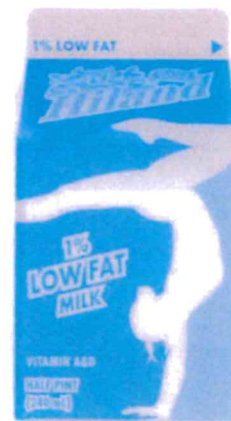
1% MILK Item #9171