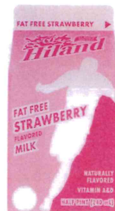
FAT FREE STRAWBERRY Item #9177

INGREDIENTS: GRADE A FAT FREE (SKIM) MILK, SUGAR, ALKALIZED COCOA, CORNSTARCH, SALT, CARRAGEENAN, NATURAL AND ARTIFICIAL FLAVORS, VITAMIN A PALMITATE, VITAMIN D3. CONTAINS MILK.