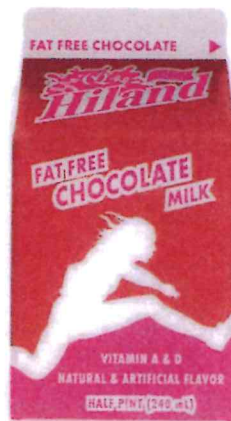
FAT FREE CHOCOLATE Item #9178

INGREDIENTS: GRADE A FAT FREE (SKIM) MILK, VITAMIN A PALMITATE AND VITAMIN D3. CONTAINS MILK.