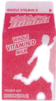
WHOLE MILK Item #9165