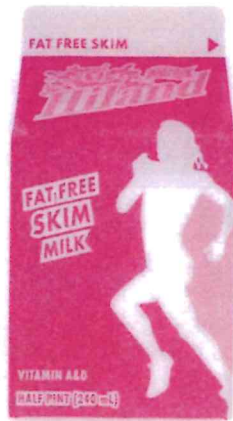
SKIM MILK Item #9173