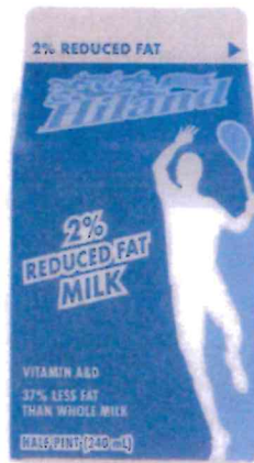
2% MILK Item #9168