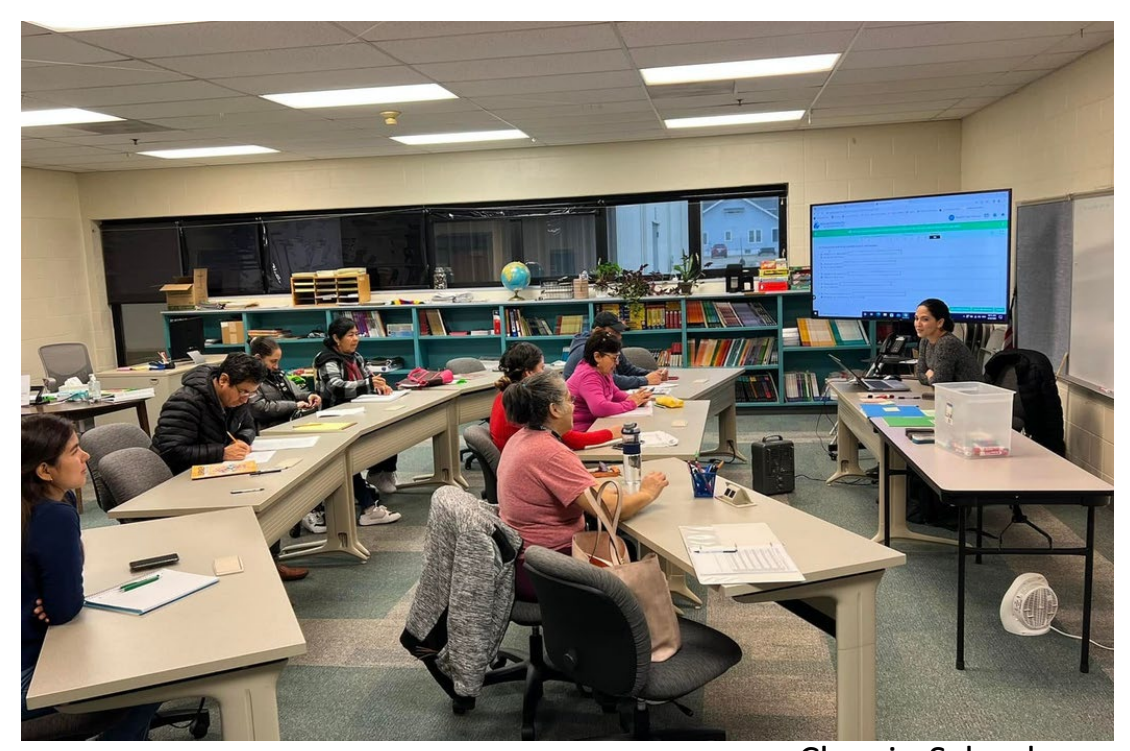
Class in Schuyler