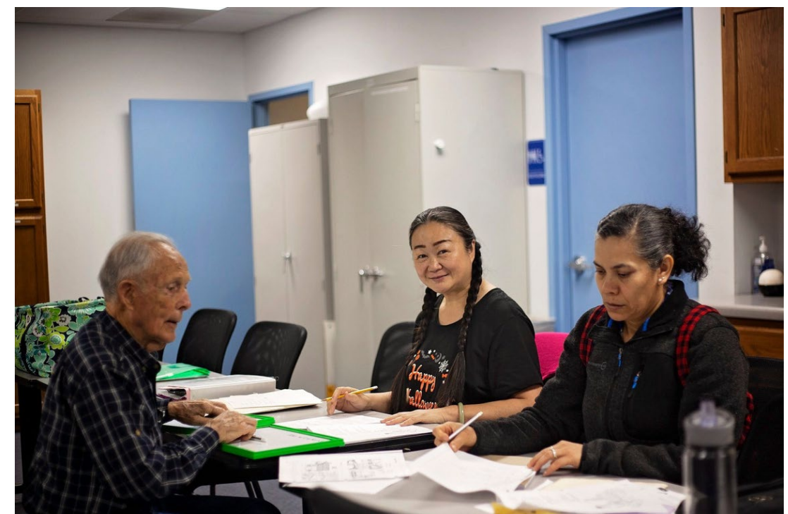
Students and Volunteer in Hastings