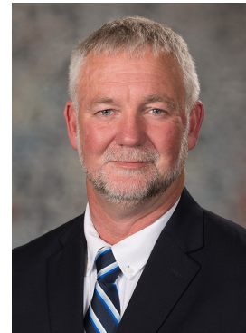
Sen. John Lowe District 37

governing body of the county, city, or village conducting the lottery, digitally to a mobile or other device which, at the time of purchase, is verified to be present at the location of the lottery operator or an authorized sales outlet location.”