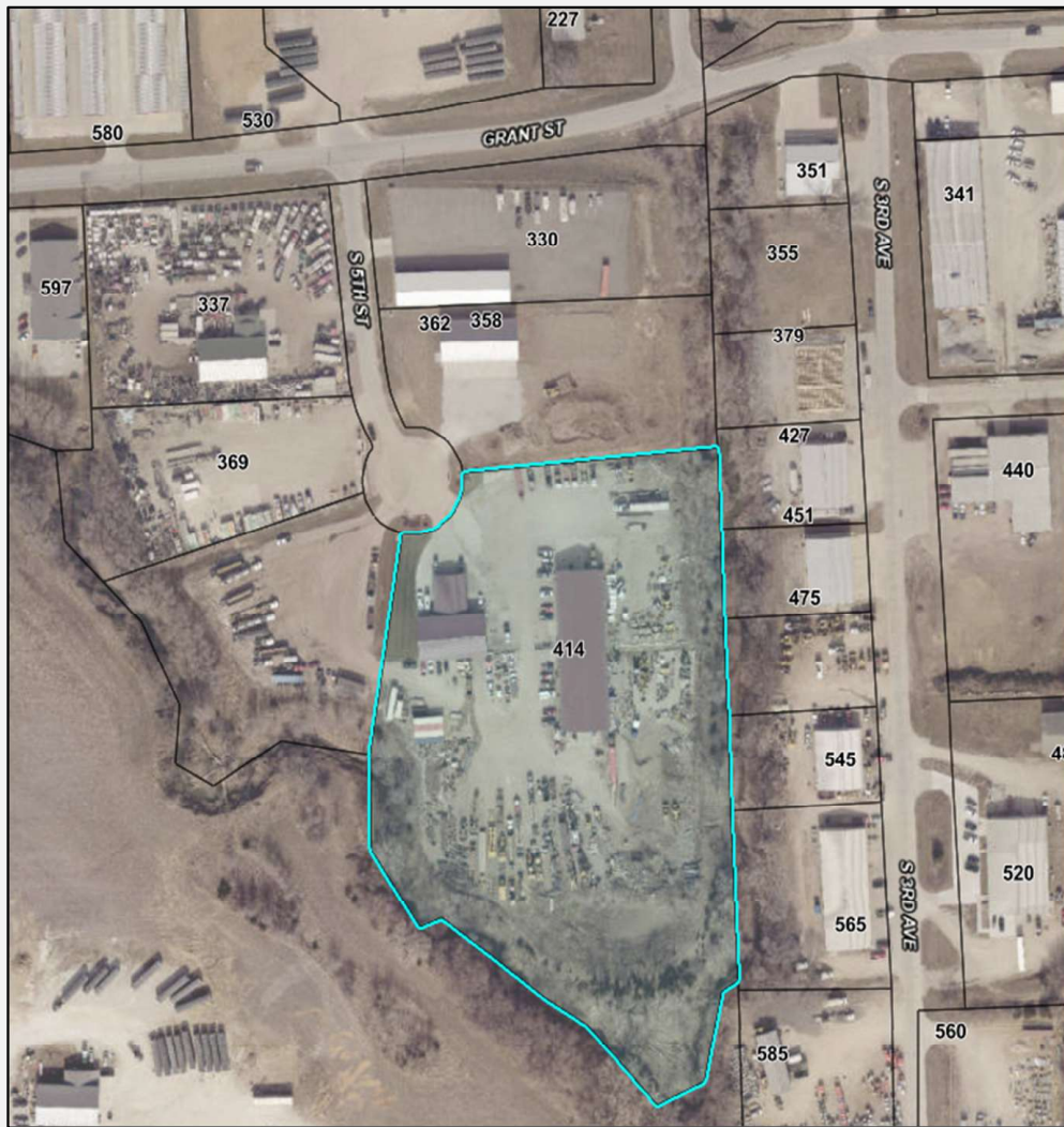
414 S. 5 th Street/Lot 4, South Acres Subdivision