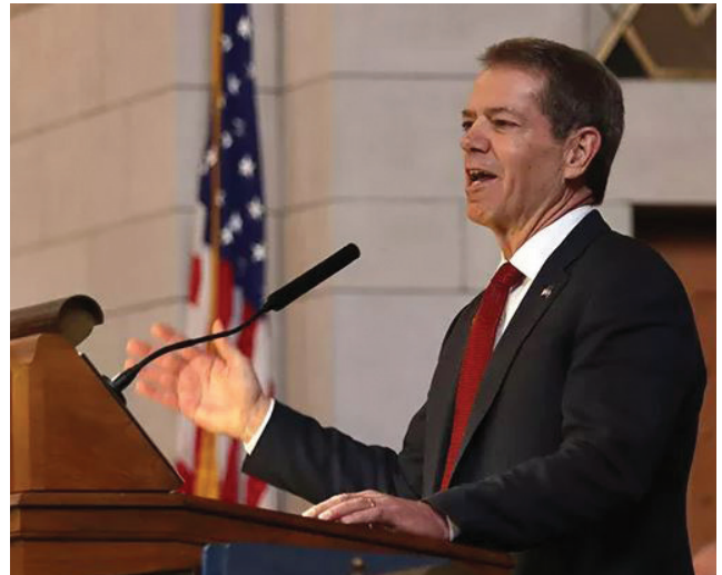
Gov. Jim Pillen outlined a series of tax proposals and funding changes to the state's education system in his first State of the State address on Jan. 25.

Our family watched as Suzanne faced the many blessings and challenges that came with being her mom's caretaker and advocate. Whether caring for a relative who is elderly, ill, disabled, or struggling with mental health or substance