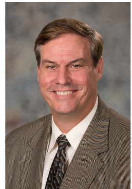
Sen. Mike McDonnell District 5

Source — Nebraska Examiner. See the Nebraska Examiner at https://nebraskaexaminer.com/