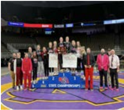
YUTAN—CLASS B GIRLS WRESTLING STATE CHAMPIONS!