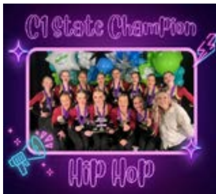
CLASS C1 HIP HOP: Conestoga