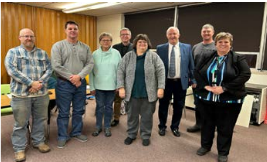
CREEK VALLEY BOARD OF EDUCATION AND ADMINISTRATION

If you would be interested in me attending a future Board meeting, please contact me to start the arrangements. I would also be willing to "attend" your Board meetings via Zoom if you preferred. I would still only do one at a time but would be able to do several in the same evening. Let me know and we will try to make the connection.