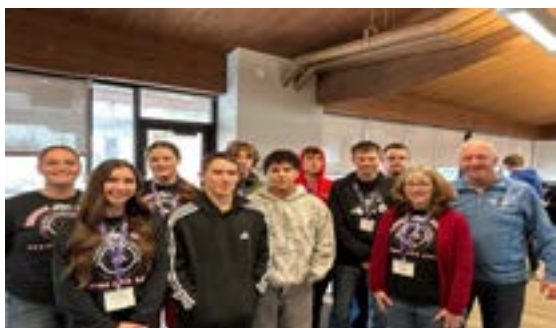
AMHERST ACADEMIC DECATHLON TEAM