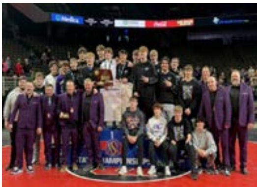
BATTLE CREEK—CLASS C BOYS STATE WRESTLING CHAMPIONS!