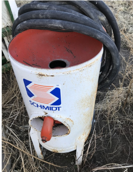
4. Schmidt sand blaster & hose