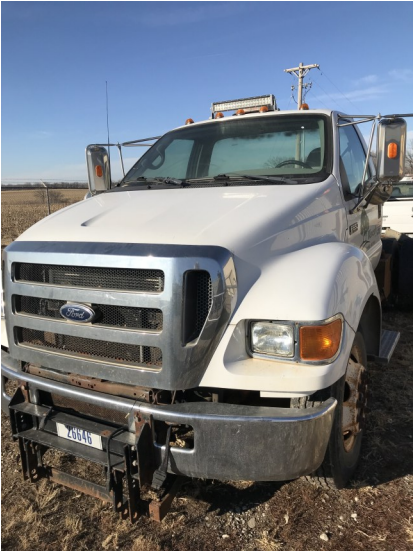
1. 2004 F650