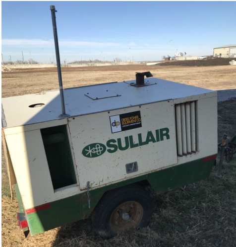
2. 1979 Sullair air compressor