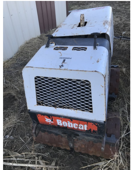
6. Bobcat trench roller