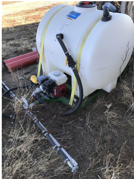
5. 250-gallon tank sprayer