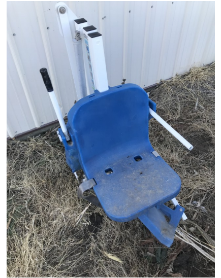
7. Electric swimming pool lift chair