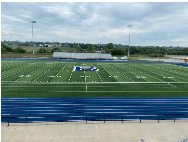
BHS Track resurface project.