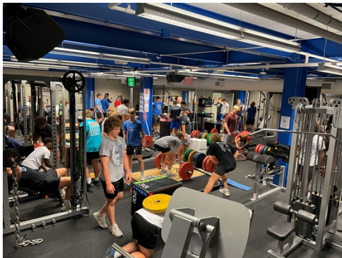
Summer Conditioning – 9:00 am session.