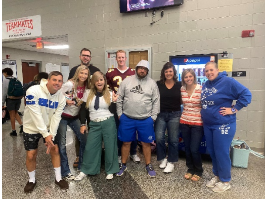
BHS Staff – Homecoming Dress Like a Student Day