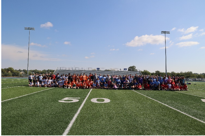
Games on the Green – September 19, 2024