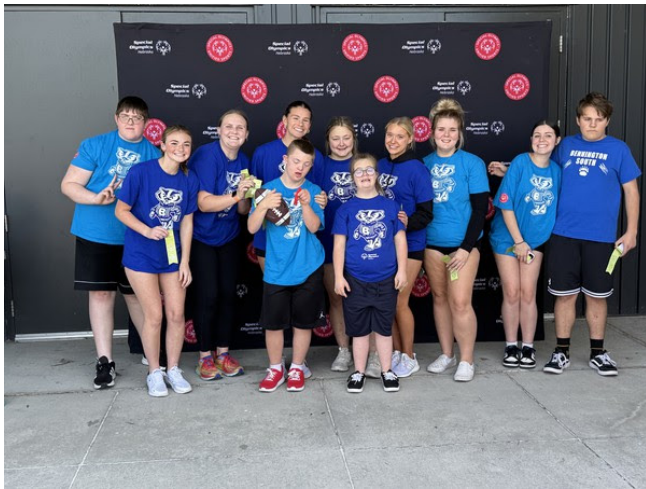
Special Olympics Flag Football – October 2 in Papillion