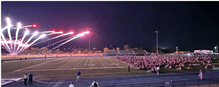
2024 Homecoming Fireworks