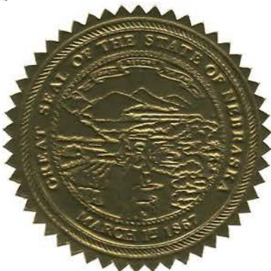
Pete Ricketts, Governor State of Nebraska