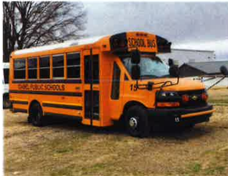
New Bus for Even Start & Adult Ed Programs

With the recent pay raises these new funds are much needed to cover the extra district personnel costs.