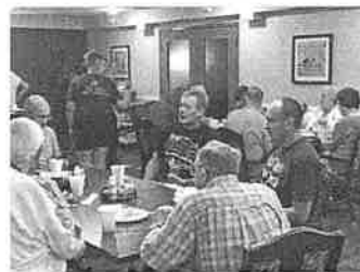
Enjoying Breakfast at Kinship Pointe