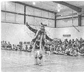
Our 6th Grade Student at Outdoor Ed

PLC Days- We are going to try a different format for our PLC's during the months of September, October, February, and March. As you know, we meet twice a month for PLC's, during the months above we will meet once as normal, and the second meeting will be during the PLC day. You will still have your normal PLC team during PD Day PLC'S, but we will use this time to extend and apply what we have learned during the professional development session. More information will come about this.