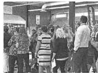
HS Welcome Back Tunnel Walk