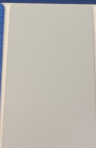
New Countertop in FCS Kitchens Wilsonart - Fashion Grey D381-60