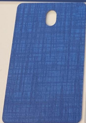
New Backsplash in FCS Kitchens Wilsonart - Blue Curacao Y0353-60