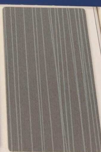
FCS Cabinets Wilsonart - Cosmic Strandz 4941k-18